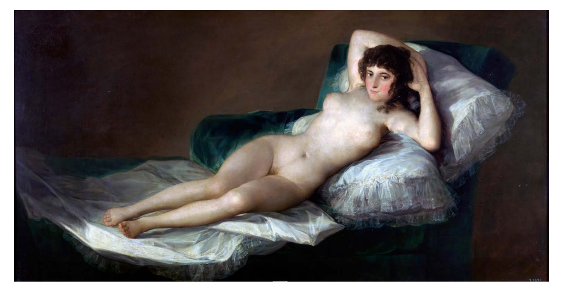
Figure 1. La Maja Desnuda (The Naked Maja), 1795 – 1800, by Francisco Goya. Oil on canvas.

to explicitly make such a representation was possibly Goya's The Naked Maja . This was regarded by many at the time as pornographic, as later would be a painting it greatly influenced, Manet's Olympia , which though it does not feature pubic hair, was scandalous in being a portrait of a courtesan rather than an idealized female figure of myth.