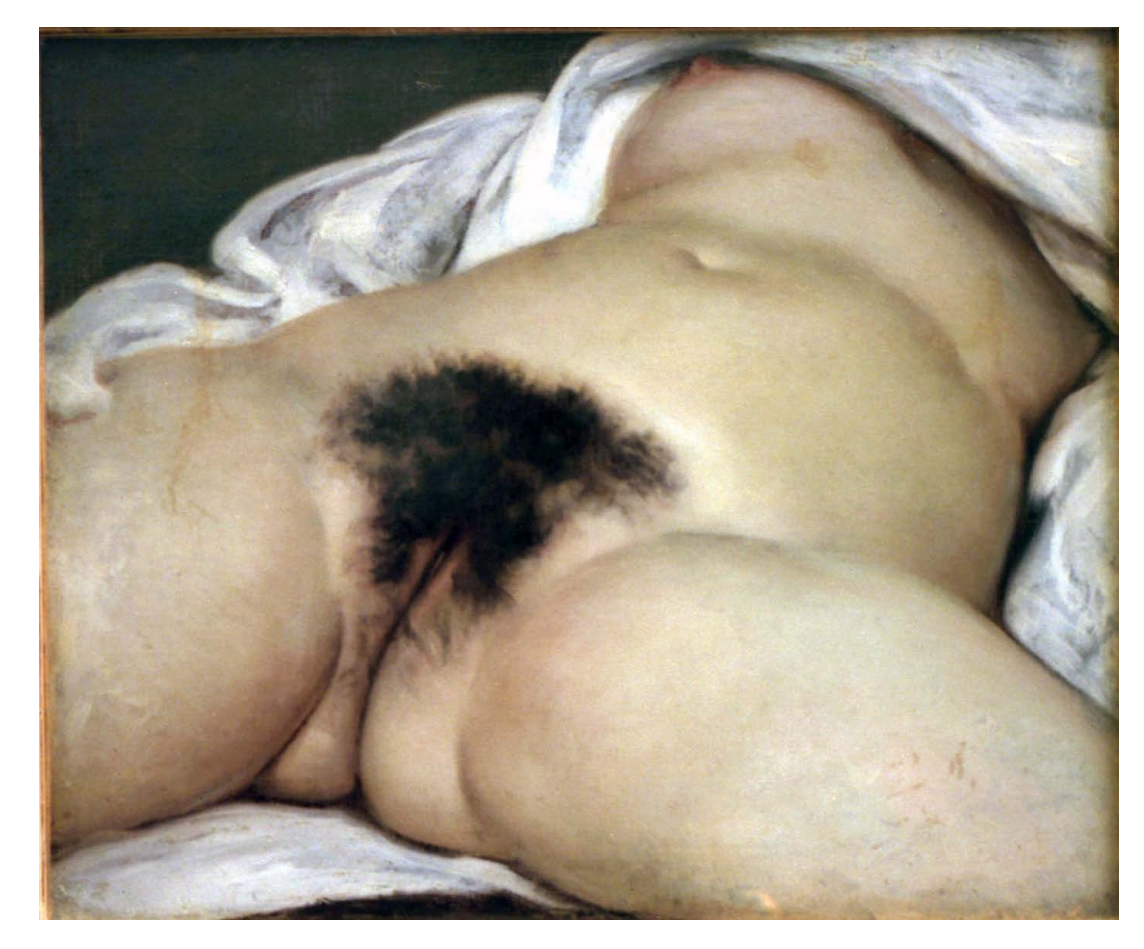
Figure 2. L'Origine du Monde (Origin of the World), 1866, by Gustave Courbet. Oil on canvas.Photo by Unknown. Used with permission via the Creative CommonsAttribution-Share Alike 3.0 Unported license.

that, in a sense, manifests this most obviously, is of course Courbet's L'Origine du Monde. This notorious painting shows nothing less than what would now be called a 'beaver shot,' or in other words an explicit and detailed rendition of female genitalia, complete with copious pubic hair. To add to the image's transgressive and pornographic air, the model is covered by a sheet above the breasts. It is believed that the model for the image may have been Joanna Heffernan, who was painted by Courbet a number of times. She was Whistler's mistress at the time, and the subject of Symphony in White no. 1: The White Girl, a far more idealized portrayal of femininity. Courbet and Whistler are both artists who eschewed the narrative and this moralizing functions of art, and instead practiced forms of realism that aimed to paint the world as it is, which is manifested in L'Origine du Monde . The title of the painting, while alluding to the role of female genitalia in procreation and birth, also seems to hint at a theological element: God is the origin of the world, the prime mover. If, as I suggested God is the ultimate example of what must not be looked at, what is obscene, then the female genitals are in some way an image of God (not least also because they are regarded