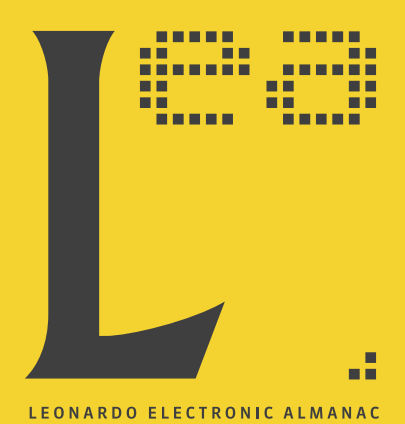
VOL 19 NO 4 VOLUME EDITORS LANFRANCO ACETI & DONNA LEISHMAN EDITORIAL MANAGERS SHEENA CALVERT & ÖZDEN ŞAHİN

What is the relationship between contemporary digital media and contemporary society? Is it possible to affirm that digital media are without sin and exist purely in a complex socio-political and economic context within which the users bring with them their ethical and cultural complexities? This issue, through a range of scholarly writings, analyzes the problems of ethics and sin within contemporary digital media frameworks.