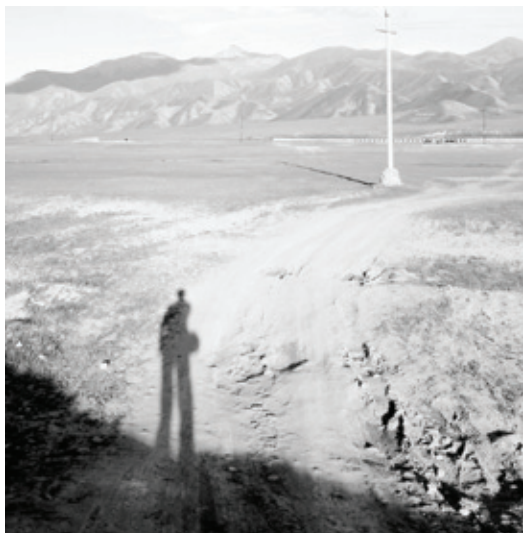
Figure 1. Incidental shadow vs intended shadow

Such nuanced interplay would go even more unnoticed when the reflective process becomes instantaneous. It can be illustrated by the case of shadow play. Consider the difference of natural moving images (e.g., incidental shadows) and author-intended animated images (e.g., shadow puppetry) (Figure 1). The two images can be materially the same. To Hutchins, neither representation may be valuable as a material anchor because they are not faithful representations of an object sufficient for offloading cognitive processes, they are just simple silhouettes. However, the latter can be an elastic anchor for conceptual blends in which the silhouette in action embodying a visceral sensation is blended with the viewer's mental image of an entity (whether human, animal, or even an anthropomorphic object) moving in a similar fashion, thus forming an imaginative understanding that the shadow is cast by an actual character in that mood. On the audience side, this blended image is the meaning of the puppet show. On the puppeteer's side, this might be an interim image with which the puppeteer would finetune for another animated shadow. In both cases, the