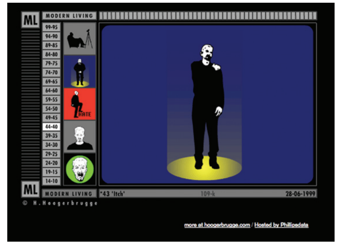
Figure 4. A screenshot of #43 'ttch' in Modern Living (1998–2001). Image courtesy of the artist (Han Hoogerbrugge).

Like many works of art, Text Rain is exhibited publicly in an art gallery or similar setting. In contrast, another work to be discussed emerged in a strikingly different platform. It was originally intended to show on the Web. Since 1997, the Dutch comic artist Han Hoogerbrugge has used the Internet to publish interactive animated comics on his website Hoogerbrugge.com. The first work, Modern Living (1998–2001), featuring nearly one hundred short animated films, tackles small observations in his personal life, which also resonate users' lives. The collection can be seen as a documentation of his experiments with mouse-mediated interaction in which immediate blending helps us re-map mouse action to different intentions easily. For instance, in #43 'Itch', a click makes the character "itch" wherever the mouse cursor is located (Figure 4). In #54 'Jumpy', a mouse-over action "drives" the character jump forward. In #60 'New Religion', when the mouse moves across the characters, they stand up and then bend down forming a wave very much like the magnification effect in Mac Dock. In #61 'Drowning', one can move the mouse to play hide-and-seek