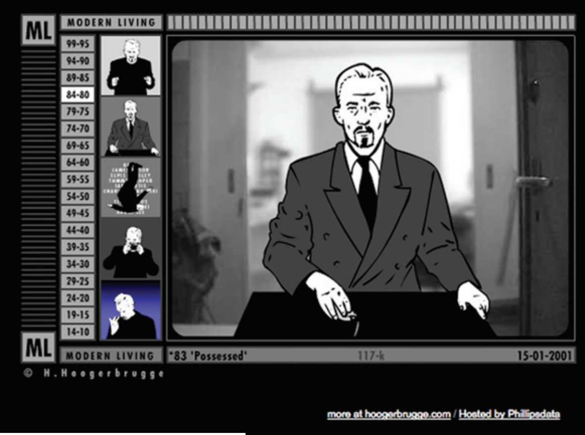
Figure 5. A screenshot of #83 'Possessed' in Modern Living (1998–2001), which provokes immediate and metaphorical imagination.

with the character. In #68 'Obedience', keeping the mouse over the character's head can "bend" him down to his knee. In #70 'Eternal Love', the position of the mouse determines the focusing point. Through these couplings of motor action and animated feedback, the work mobilizes motor-sensory connection and projects what we have called an expanded illusion of life.