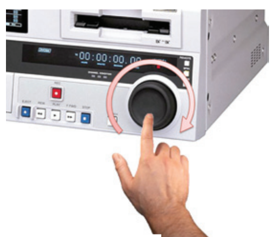
Figure 2. Use of the jog dial of a VTR

If the animated images are instantaneously reactive, as in shadow play, the elastic anchors include not only sensory perception, but also motor action. In digital interactive media, elastic anchors are even more adaptable and elaborative, because a user might interpret his or her motor input quite variably according to the perceived generative feedback. For an interactive system, generative animated feedback often defines, or re-defines, the meaning of motor input action. For example, when a user scrolls the view of a window using two fingers on the touchpad of an Apple laptop, the scrolling effect defines the action as moving the viewpoint because the scrolling direction is the same as the finger motion. When a user touches and moves a finger on an Apple iPhone screen, the contrasting scrolling effect (just in the opposite direction) redefines the action as moving the panel instead. A few other examples follow. Turning a new page on the iPhone screen by tilting the device defines the action as flipping. Leaving marks on a touch screen defines the touch-and-move action as drawing. A swarm of particles following a pointer defines the action of moving the pointing device as choreographing. Furthermore, the magnification effect of the Dock in