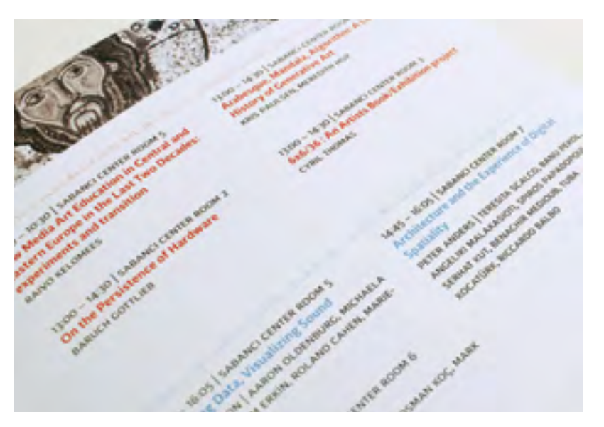
Detail from the ISEA2011 program booklet.