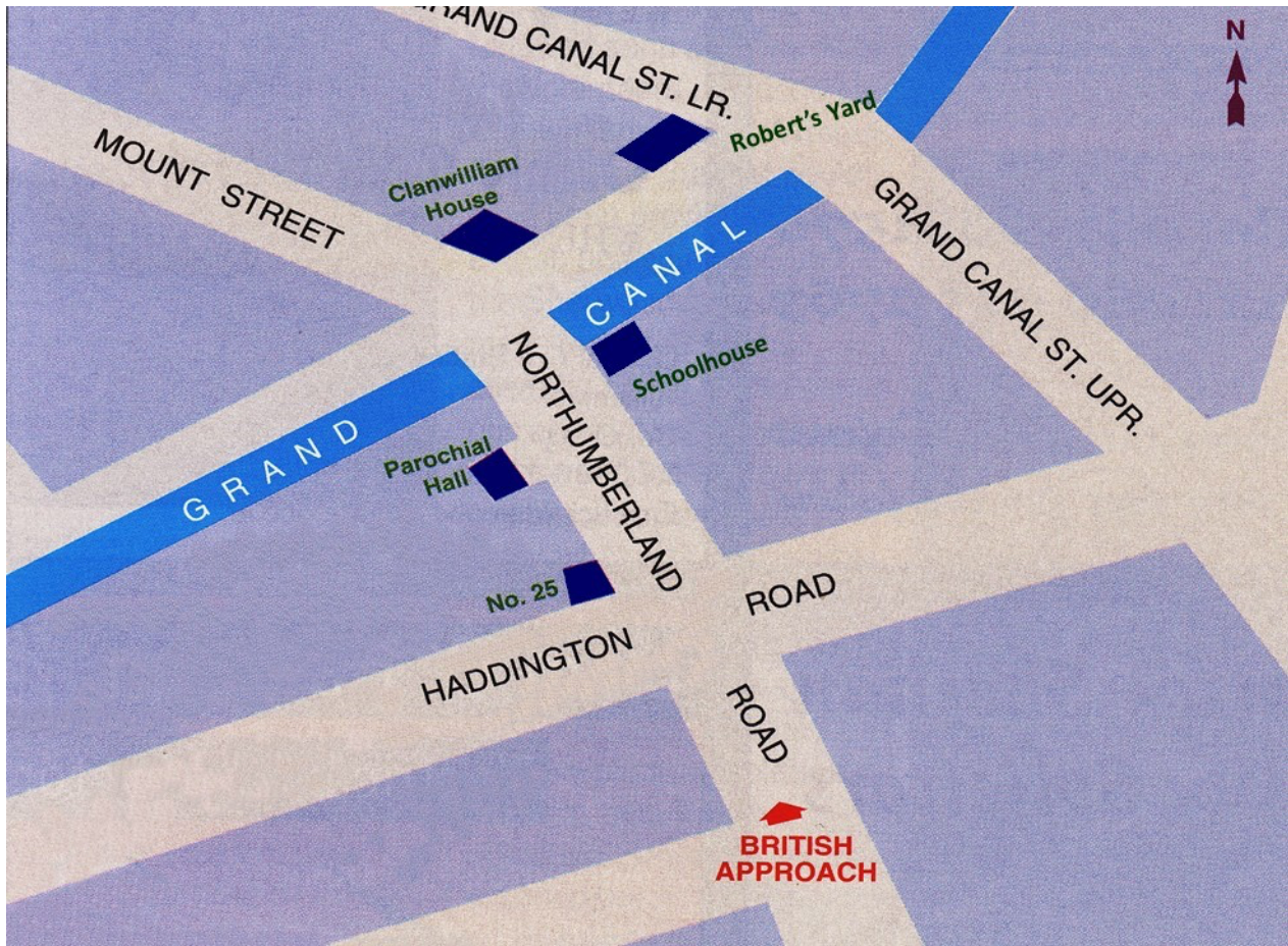
Figure 2. Locations of Volunteer outposts in the Mount Street Bridge area

By Wednesday, two men, including Malone, had occupied 25 Northumberland Road, which is at the junction of Haddington Road and 200 metres southwards from the bridge; four occupied the Parochial Hall, which is on the west side of Northumberland Road and 100 metres southwards from the bridge; seven occupied Clanwilliam House, on the northern side of the bridge 50 . This force was supported on its left flank by four riflemen positioned in a builder's yard 100 metres east of the bridge on the north bank of the Grand Canal. 51 Throughout the operation the builder's yard position remained under the control of the commander of C Company, who was located with battalion headquarters fifty metres to its north. This resulted in a somewhat unusual command structure in that the officer in charge of the operation did not exercise control over all the troops intimately involved in defending the bridge. The Volunteers manning the builder's yard position were