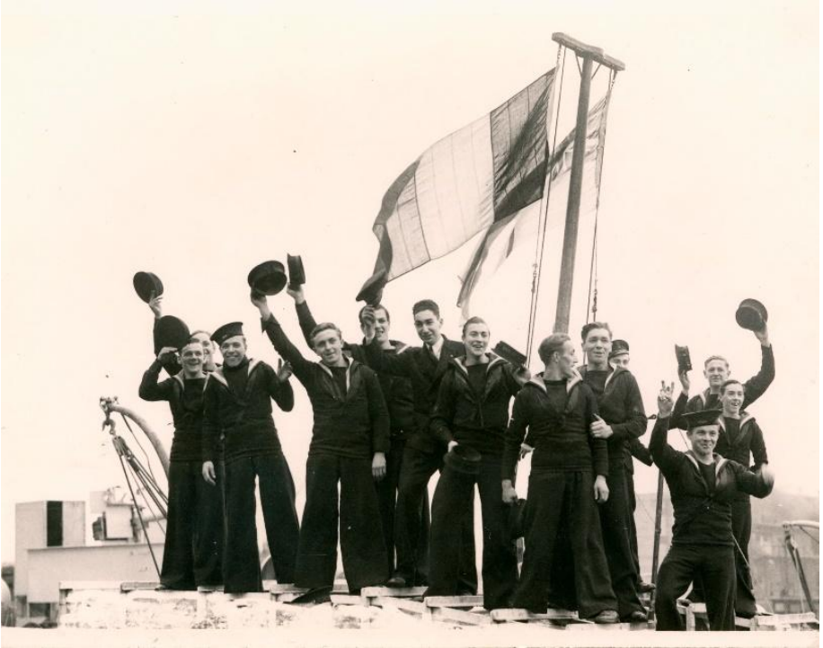
Figure 6: Crew members on a corvette standing atop the depth charge racks with the British naval ensign and the Belgian national flag in the background. 37

The RN allocated two corvettes to the RNSB in early 1942. HMS Godetia was manned by the RNSB in early February 1942 upon completion. HMS Buttercup followed in April 1942. The two vessels had similar careers, spending much of their time in the North Atlantic escorting convoys. Both had a British commanding officer at first with Belgians taking command in 1943.