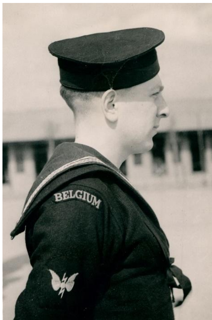
Figure 5: A Belgian radio operator with 'BELGIUM' shoulder tab 36

The RNSB manned, either partially or fully, five patrol vessels during 1941. While each vessel crewed by another navy, no matter how small, helped the RN carry out its many and varied responsibilities, the RNSB small craft were unlikely to encounter the enemy often. To take the fight to the Germans, the Belgians needed bigger ships designed for active service. As was done for most of the exile navies, the British provided 'Flower' class corvettes to the Belgians. These ships were ideal because of their small size, simple construction, and similarity to commercial fishing or whaling vessels.