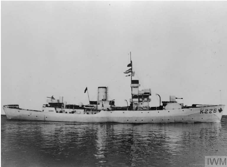
Figure 8: Flower Class corvette HMS Godetia . The absence of a background suggests the image of the corvette was altered by a censor to remove clues about the ship's location. Note also the ship's pennant number and the false bow wave painted on the hull to mislead an enemy about the ship's speed. 41

HMS Godetia (Figure 8 above) served in the Caribbean between June and December 1942. Switching to the main trans-Atlantic routes in January 1943, Godetia was part of the escort for convoy SC-122 in March 1943. Godetia was involved in the scuttling of another escort vessel protecting SC-122 when the minesweeping trawler HMS Campobello sprang a leak during bad weather. Godetia provided the depth charge needed and took off the crew. In September 1943 while escorting a convoy from Gibraltar to Britain, the ship was attacked by German aircraft but without damage incurred. Godetia also participated in the Normandy invasion of June 1944 and reverted to British manning in December 1944 for the same reasons as did Buttercup . 42