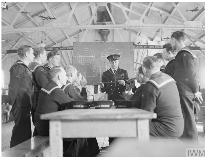
Figure 4: Belgian Marine sailors, Liverpool 30 April 1943, DEMS Training. Note the sailors' caps on the table with the ribbon 'Belgian Marine' although they are not all wearing the 'Belgium' shoulder tabs. 30

In addition to the RNSB, there was another Belgian military force operating at sea. While some of the Allied navies including the Dutch and Norwegians provided gun crews for their merchant ships, the Belgians in November 1940 chose to create a separate force called the Belgian Marine. The Belgian Army loaned men to the Belgian Marine who were trained at the RN's Defensively Equipped Merchant Ships (DEMS) facility in Liverpool. 29 Belgian Marine personnel wore British naval uniforms with a cap tally marked 'Belgian Marine' and they wore 'BELGIUM' shoulder tabs. The Belgian Marine was disbanded at the end of the war.