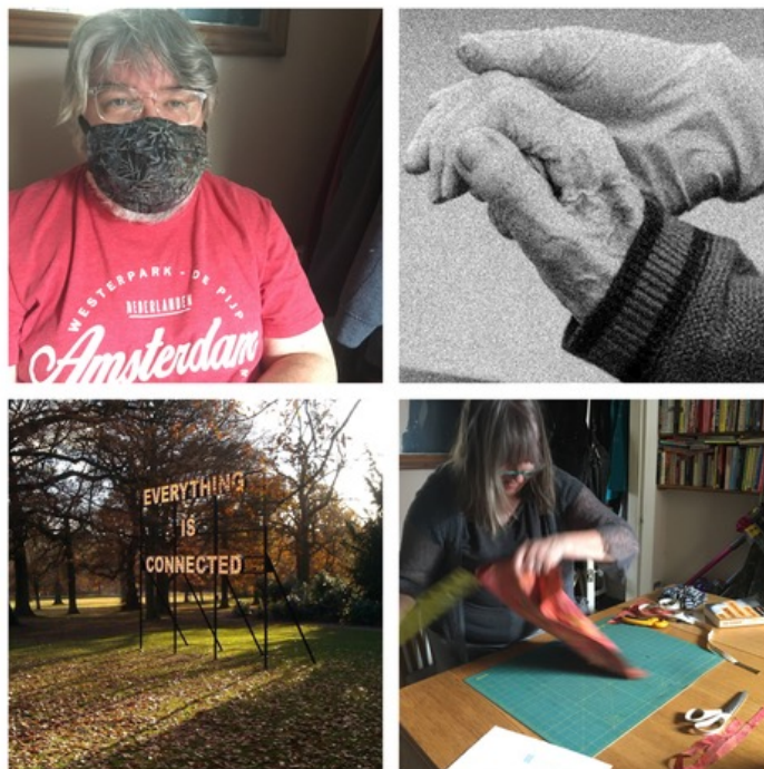
Insert Fig. 6 here

Each day I set myself the task of selecting a minimum of four images that represent something of significance that had occurred in my inner world (a memory, perhaps) or a scene I had observed and recorded, frequently during long walks I had started taking.