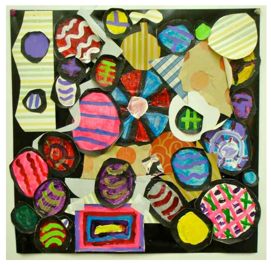
Figure 3: Dixie Manley, Untitled , wall paper, fabric, canvas, acrylic paint on adhesive plastic, 4' x 4', 2011

Figure 2 provides a view of five different uses of circles where a wide range of size, surfaces, technique and a variety of media have been used. How the circle is incorporated varies ranging from as elaborate detail, to being used as a small compositional element or focal point.