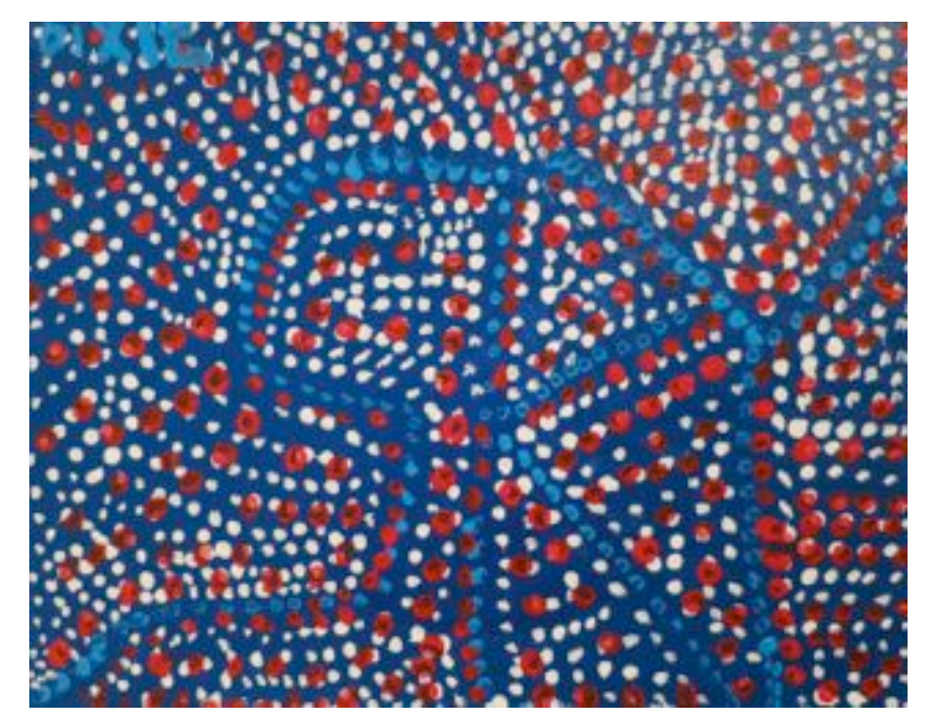
Figure 5: Dixie Manley, Sky , acrylic on canvas board, 18" x 24", 2014.