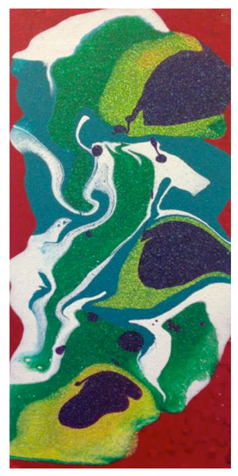
Figure 6: Dixie Manley, Untitled , acrylic paint and glitter paint on canvas, 12" x 28", 2014.