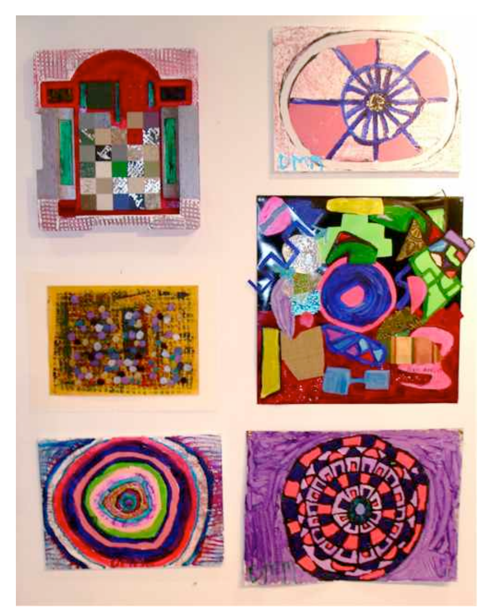
Figure 2: Dixie Manley, paintings and collages, mixed media, varied sizes, 2010.

her art-making and how she used traditional and non-traditional art materials. Dixie was open to 'paint on anything', which included wooden or Styrofoam surfaces, recycled boxes, as well as two and three dimensional objects. Dixie was a prolific painter and often developed images using specific abstract and representational motifs. Leaves, interlocking line and shape or 'puzzle pieces', and circles are repeatedly used as familiar approaches to explore media, composition and technique. One form that has remained central over her development as an artist is the circle, which has been explored in size and media, and as an element for compositional experimentation.